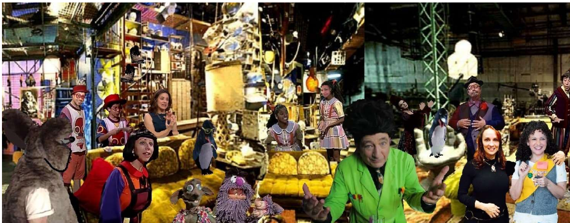
Originally posted in "Beakman Fans" on March 09, 2019.